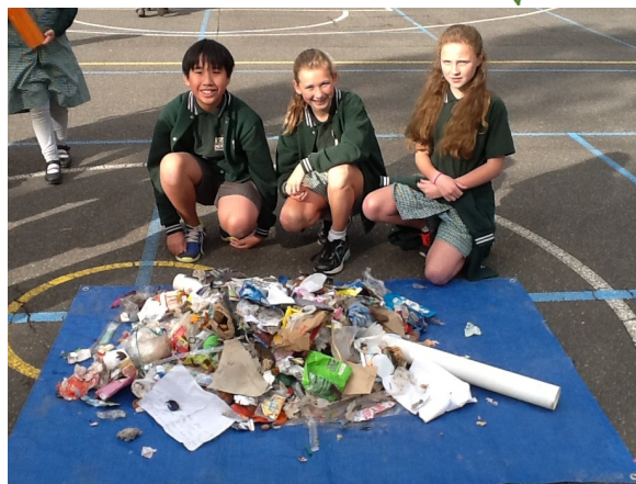
Target Tarp Tuesday results