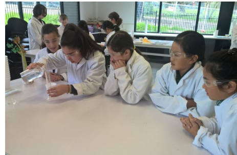
Fun in the science lab!