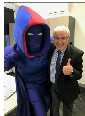
With Hector, the Nunawading Spectres mascot

This week is Education Week and there have been many opportunities for parents to find out more about what their children are learning at school. All year levels had an 'open' time for parents to come and visit, the specialist program has been open all week, our intervention staff ran a literacy tips and tricks for parents, whilst the Nunawading Spectres conducted a basketball clinic which was so popular with the children all day on Tuesday. At Assembly on Monday the 'Careers' parade highlighted the range of occupations in which the children are interested. Doctors, Police, Fireman, 'Superhero', pilots, armed services, actors, nurses, singers and many more were all present.