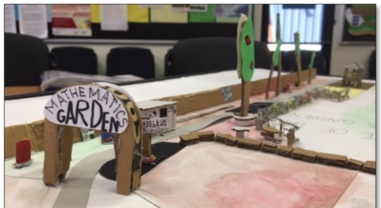
A view of the fantastic scale model of the Mathematics Garden

At the presentation of the cheque for our successful grant of $2000 in the Bank First Teaching Initiatives Program, it was announced that we had also won the People's Choice Award, providing an additional $1,000 towards the project.