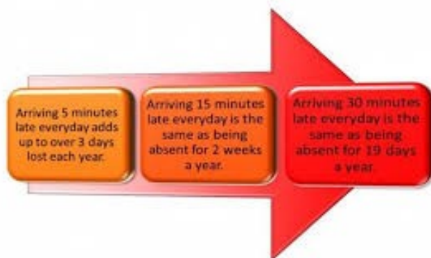
George Perini Principal

Please work with us so that we can provide the best possible learning opportunities for your children all day, every day.