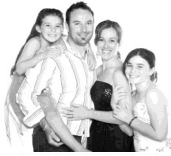
T & G PHOTOGRAPHY