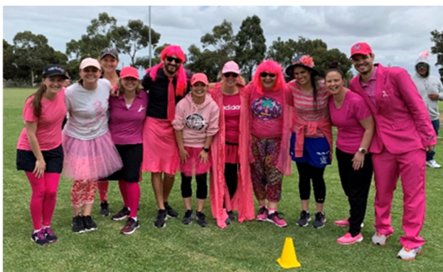
The Year 6 Teachers

Our EHPS community certainly is special!