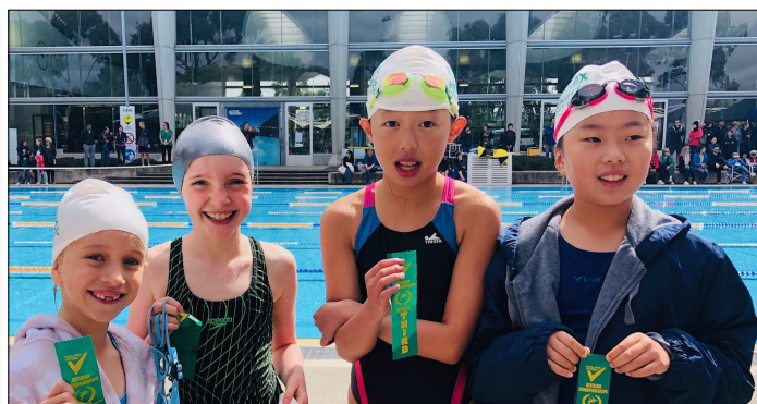
Girls 9/10 Year Freestyle Relay Team