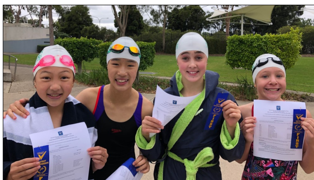
Girls 12/13 Year Freestyle Relay Team

On Tuesday the Monash Waverley Division Swimming Finals were held and 17 students participated. The children competed so well and also encouraged each other in each event. These students have progressed from our swimming trials, through District finals and now, on Tuesday, were into Division finals. Naturally at these finals the competition was harder and often only fractions of a second separated competitors.