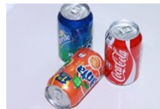
Sausages and Cold Drinks for sale

Bring a picnic rug or chair and join your children's friends