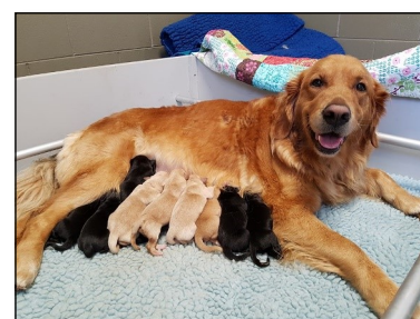
Experienced mum Flick and her last litter!

For more info: sedvolunteer@visionaustralia.org or 0428 010 843.