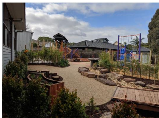
The Sensory & Meditation Garden