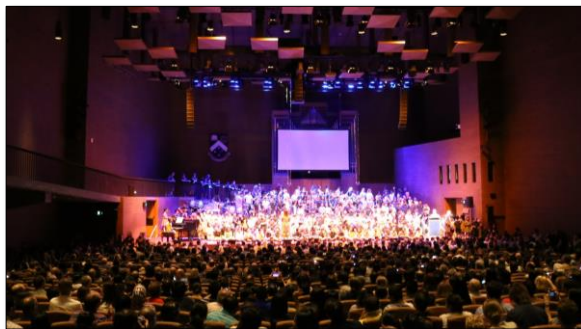
Showcase at Robert Blackwood Hall

Our annual music concert, Showcase, prepared for by all students, is performed at Robert Blackwood Hall at Monash University in Term 4. Students in Year 5 and 6 auditioned choirs participate in the North Eastern Victoria Region (NEVR) Concert at Hamer Hall at the Arts Centre in Melbourne in May and in other concerts and eisteddfods throughout the year.